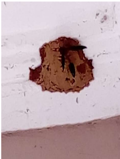
Plate I: Mud Dauber Wasp building nest on ceiling