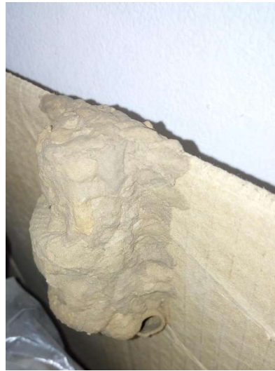
Plate II: Mud Dauber nest on carton